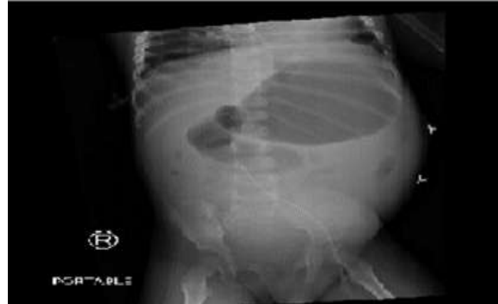
Figure 1: Abdominal plain film showed dilatation of proximal small bowel and stomach